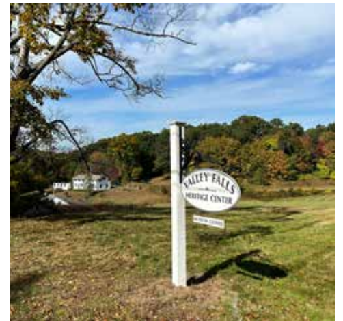
The new Heritage Center sign, at Bolton and Valley Falls Rd.