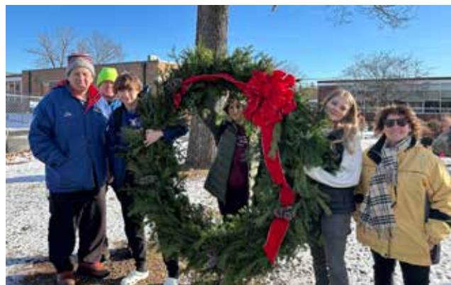
Agricultural students at Rockville High proudly showoff the wreath they made for Valley Falls Farm.

For the third year in a row the agricultural students at Rockville High School have made it possible for the Friends to continue the tradition of hanging a big holiday wreath on the side of the stable at Valley Falls Farm. The wreath is large enough to be seen from Bolton Road, across the field.