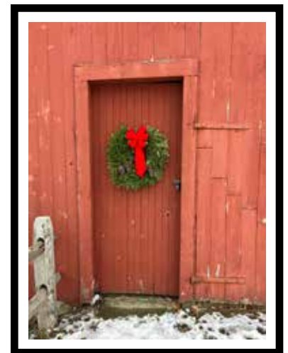
Wreaths were added to the Ice House and Red Barn this year to enhance the Valley Falls Farm winter scene.